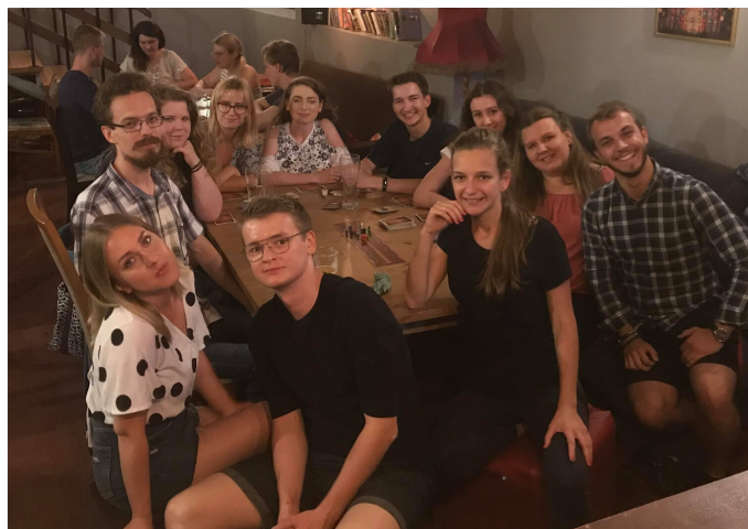
Student Mentors integration meeting, 2019

The Mentor's role is to take care of the allocated exchange student. The Mentor's help is not limited only to organisational issues, but involves meetings, trips, learning foreign languages, during all of which incoming students have an excellent opportunity to integrate better with the AIK academic community and the local environment. Very often, the friendships made during the mobility, are continued after the end of the exchange semester.