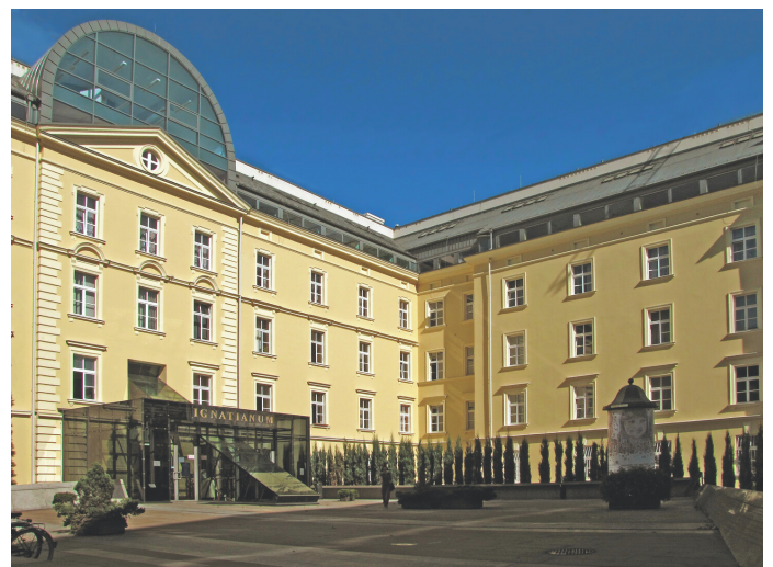
Jesuit University Ignatianum in Krakow

Participation in international organisations is one of the priorities in the scientific and educational activities of the Ignatianum. This is indicated by the membership of several prestigious international organisations, such as IFCU, FUCE or SCRIBANI. Recently, the Ignatianum has joined to a newly established but promising association, the Kircher Network of Jesuit institutions in Europe and the Near East, which is seeking collaboration to strengthen the sense of shared apostolic mission among its members in all aspects of academic life.